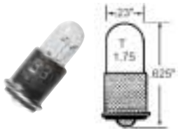
(A) Midget Flange Base