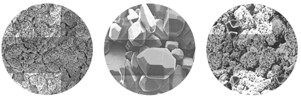
Above: 588X enlargements of a battery's lead plate. (L to R) 1. New battery-note absence of sulphate crystals. 2. After six months of misuse. 3. After three months of using BatteryMINDER.

When a battery is improperly charged (over/under) or allowed to self discharge as occurs during storage/non-use, these crystals build up on the battery's storage plates preventing the battery from ever being fully charged and therefore able to deliver their full power/capacity.