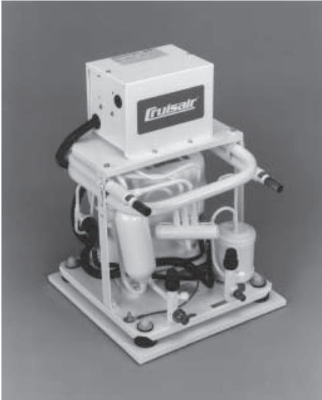
J10 Condensing Unit Shown